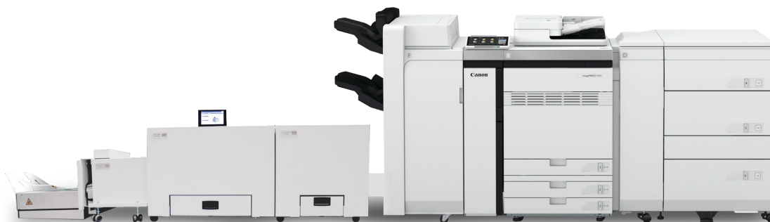
imagePRESS V900 shown with optional accessories. 2

To view detailed specifications and requirements, please consult the Customer Expectations Document.